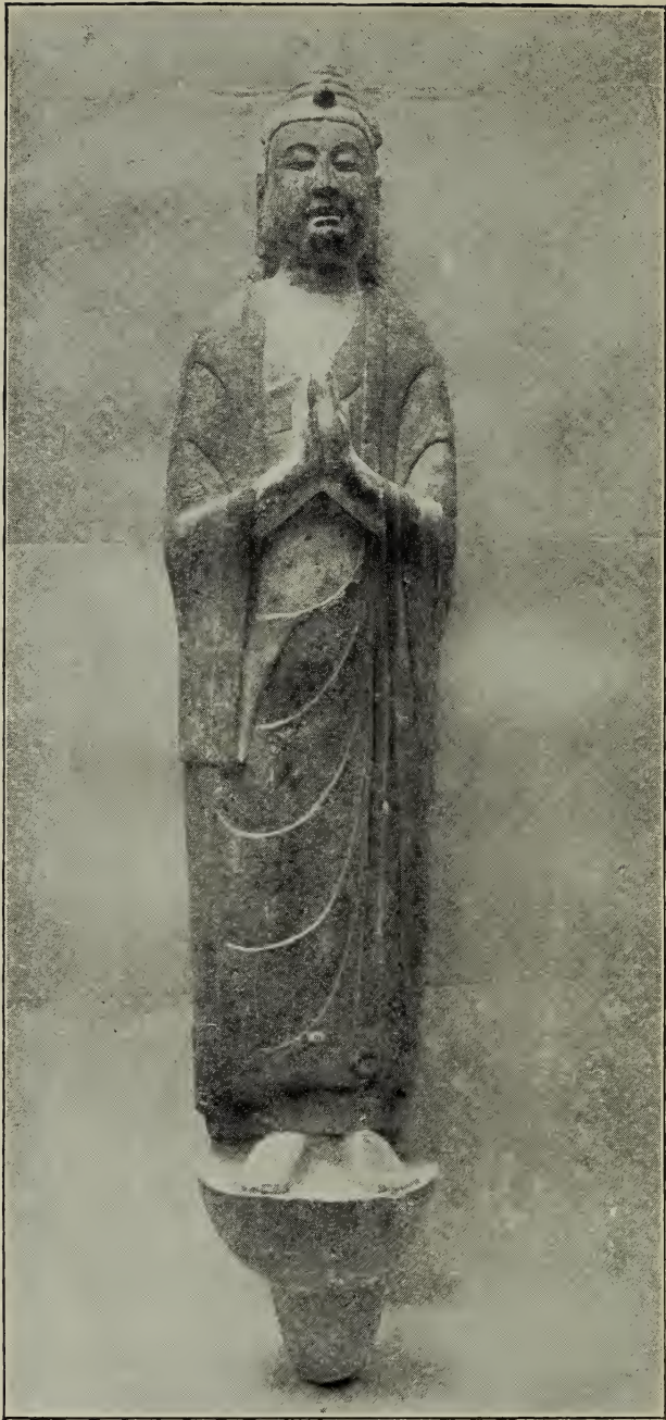
WEI FIGURE, FIFTH CENTURY